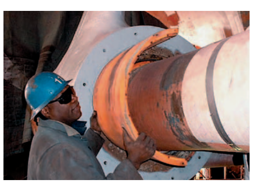
COMPAC with tapered key design allows the bearing to be withdrawn, inspected and re-installed or replaced in a few hours.