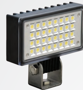
ITEM #: XIL-UF32 Shown PART #: 4001824

LIGHTWEIGHT UTILITY LED LIGHT WITH 120° FLOOD PATTERN 0.5A Amp Draw At 12V | Available In White, Amber, Blue, Green, Red | Universal Applications