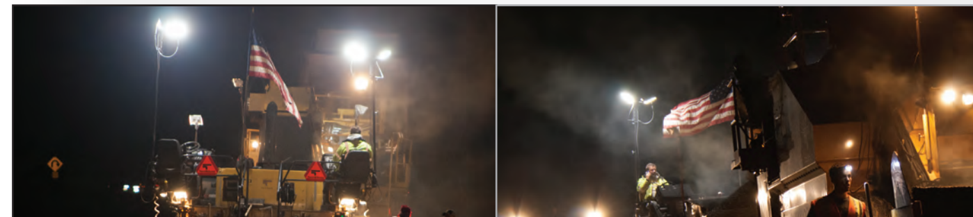
ITEM #: PVR2CSWD96AC Shown PART #: 9898384