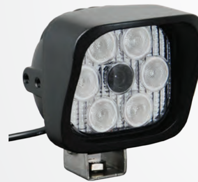
ITEM #: VEL-4460CA72SS Shown PART #: 9889856

ILLUMINATES AREA WHILE SIMULTANEOUSLY PROVIDING LIVE VIDEO FEED Kit Available With 7" Monitor (VEL-CAMMON7KIT) | Glare Blocking Shield | Infrared Model Available