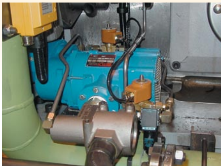
T112-V TURBOTWIN with TURBOVALVE