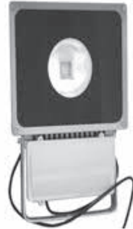
Narrow Beam LED Flood